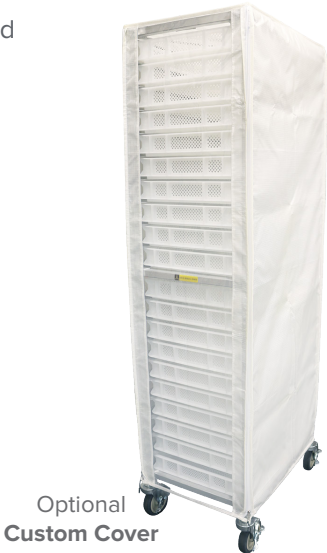
Optional Custom Cover