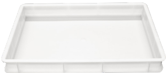
Optional Solid Pasta Tray