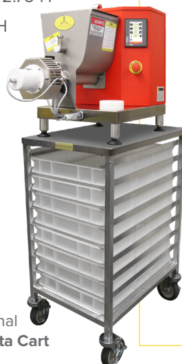
Optional APC8 Pasta Cart