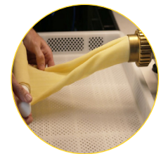
LASAGNA SHEET DIE (#60s)