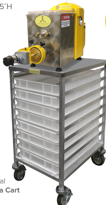
Optional APC8 Pasta Cart